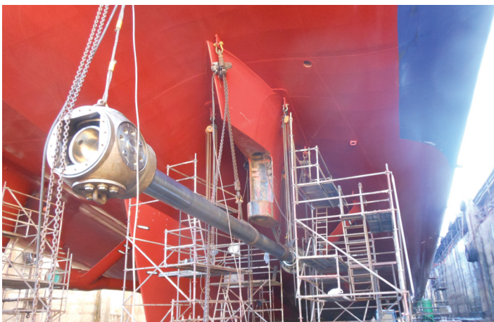
Painting the underside of our ships

Brittany Ferries uses the very latest silicon-based anti-fouling paints (coating the submerged parts of hulls) that are very low in toxicity and have the added advantage of enhancing the ship's flow through the water, therefore improving efficiency and reducing CO 2 emissions.