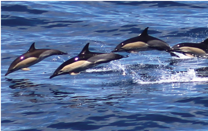
A pod of dolphins following Pont Aven in the Bay of Biscay

Brittany Ferries participates in many other research projects. For example, it works with Plymouth-based charity the Marine Biological Association (previously known as SAHFOS) as part of a global project to sample and monitor plankton levels and take readings of sea-temperature to assist scientists in assessing the effects of global warming.